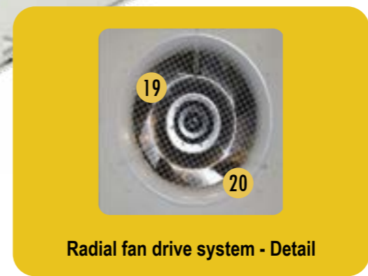
Radial fan drive system - Detail

Quantities may vary according to the unit type.