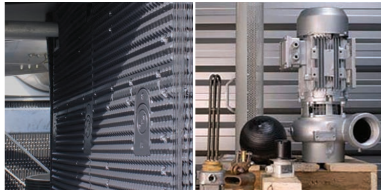
Original spare parts and fill

Using BAC original parts, ensures a first time fit and offers full traceability of your equipment history.