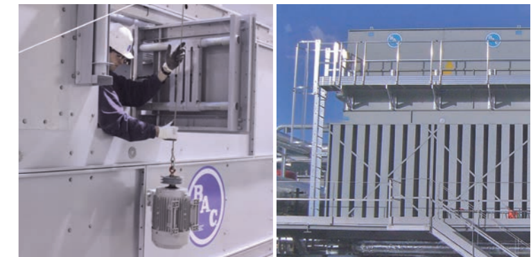
Upgrades and new technologies

These upgrades are essential to improve your equipment's efficiency and comply with any new regulations.