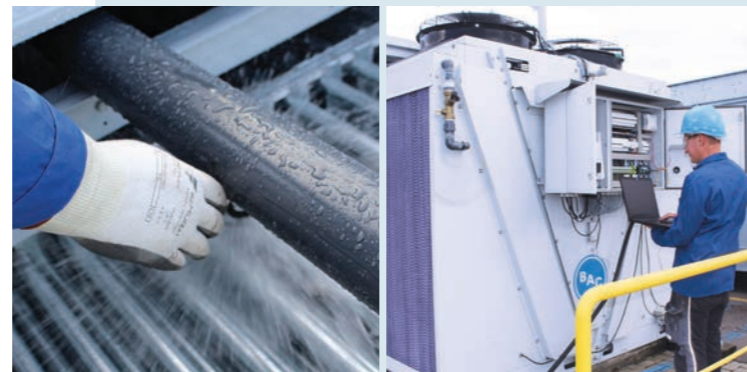
Preventive maintenance and skilled repairs

All for the most cost effective and most reliable operation of your equipment.